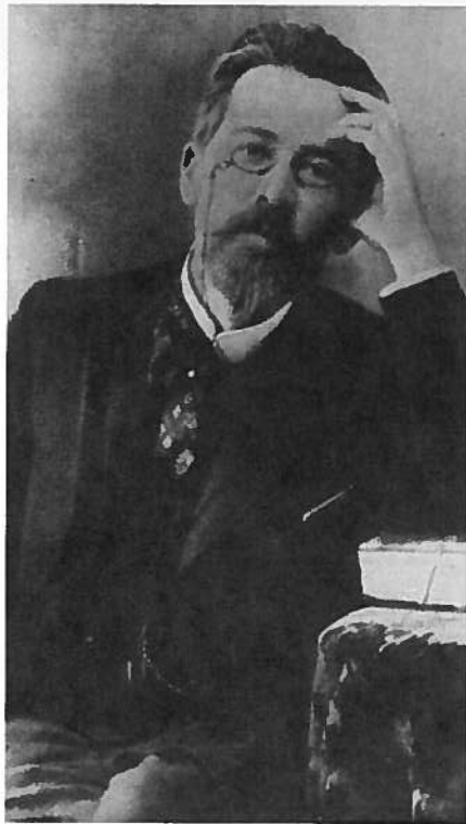
ANTON CHEKHOV (1860-1904)