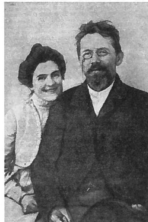
Anton Chekhov & Olga Knipper

The four plays written by Anton Chekhov in the last decade of his truncated life are among the most highly regarded of all dramatic works. Somehow, in writing this series of dramas set in provincial Russia at the turn of the twentieth century, Chekhov succeeded in depicting truths about how human beings live their lives that resonate for people in vastly different places and periods. He did so by drawing on yet breaking with the established methods of dramatic writing in the late nineteenth century. Unlike in the plays of Ibsen, for instance, in which the dramatic action revolves around revelations and reversals that occur on stage, Chekhov often has the major, life-changing events happen not only off stage, but in between the acts. As he describes his own approach, "People eat their dinner, just eat their dinner, and all the time their happiness is taking form, or their lives are being destroyed."